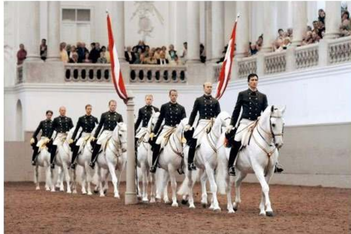
Spanish Riding School