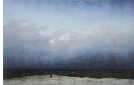
C.D. Friedrich/Alte Nationalgalerie