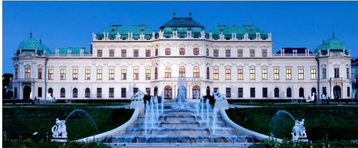
Belvedere Museum and Palace