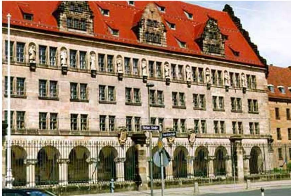
Palace of Justice Nuremberg

Options for the Remainder of the Day International Military Tribunal 1945/46