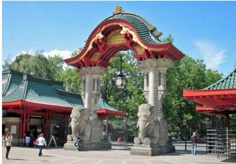
Entrance Gate of the Berlin Zoo

Free Day Independent Exploration or faculty-led touring