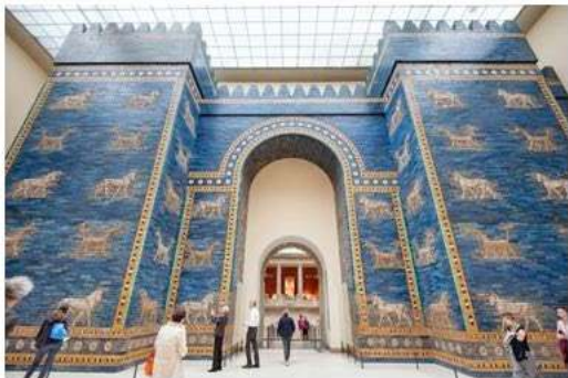
Gate of Ishtar/Pergamon Museum