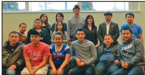
Members of the Ethnic Studies Student Organization