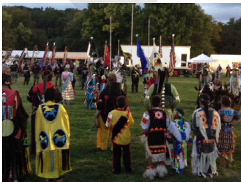
Pow-Wow opening ceremony dancers